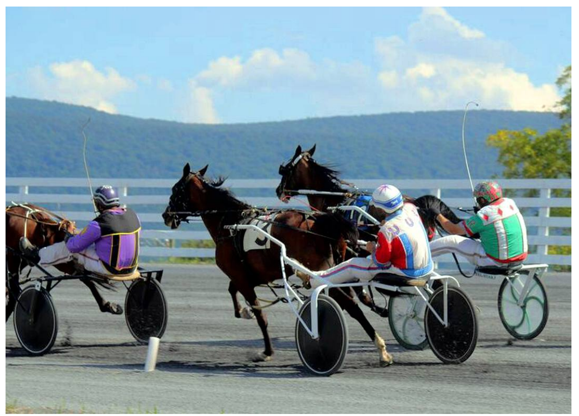
Harness Racing at Shenandoah Downs - Woodstock, VA