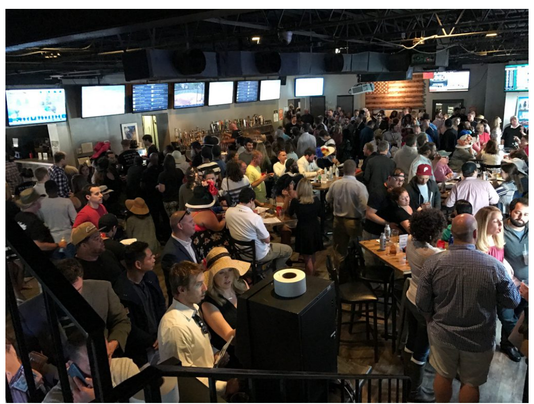
Kentucky Derby Party at Ponies & Pints Satellite Wagering Facility - Shockoe Bottom, VA