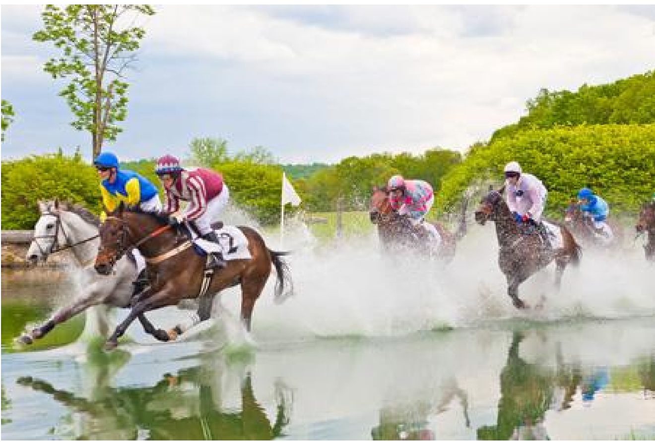
Horses competing in the Steeplethon Stakes at Great Meadow Race Course - The Plains, VA